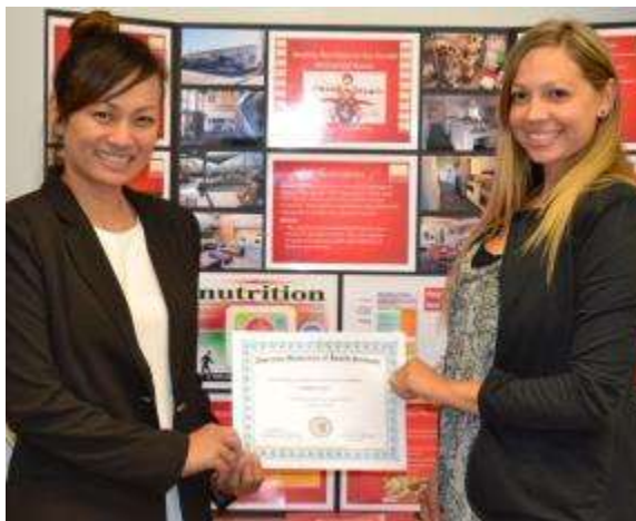
B.S. in Nursing, Student Poster Session