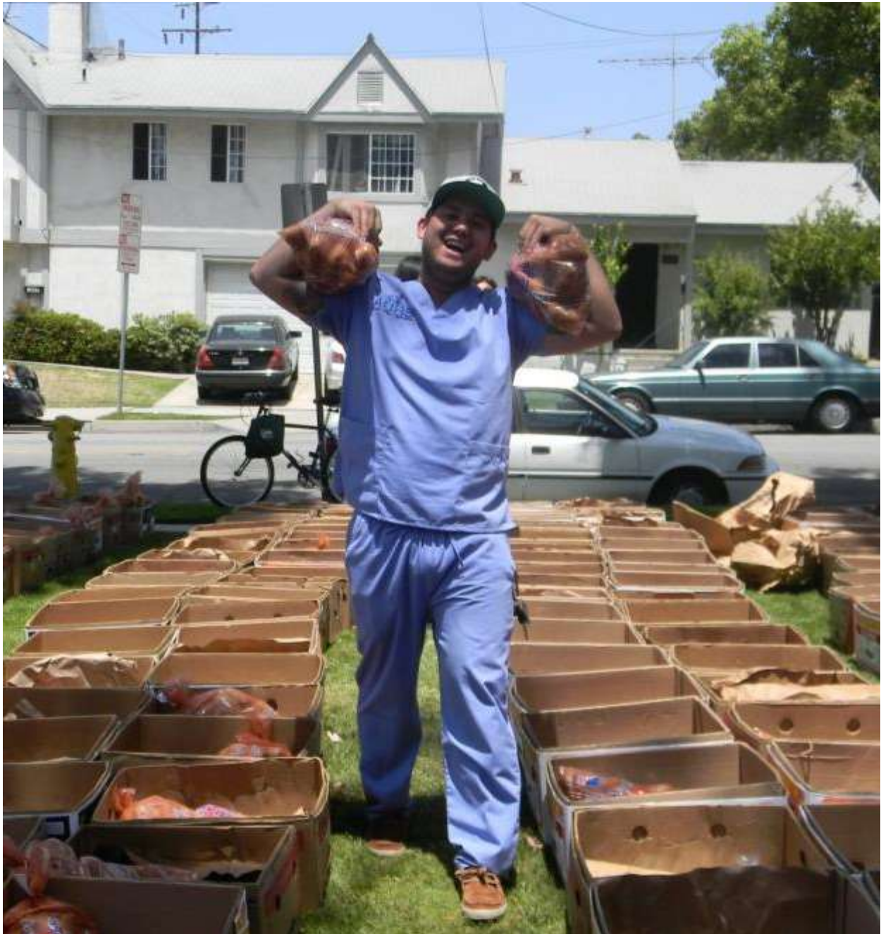
Annual Thanksgiving Food Drive