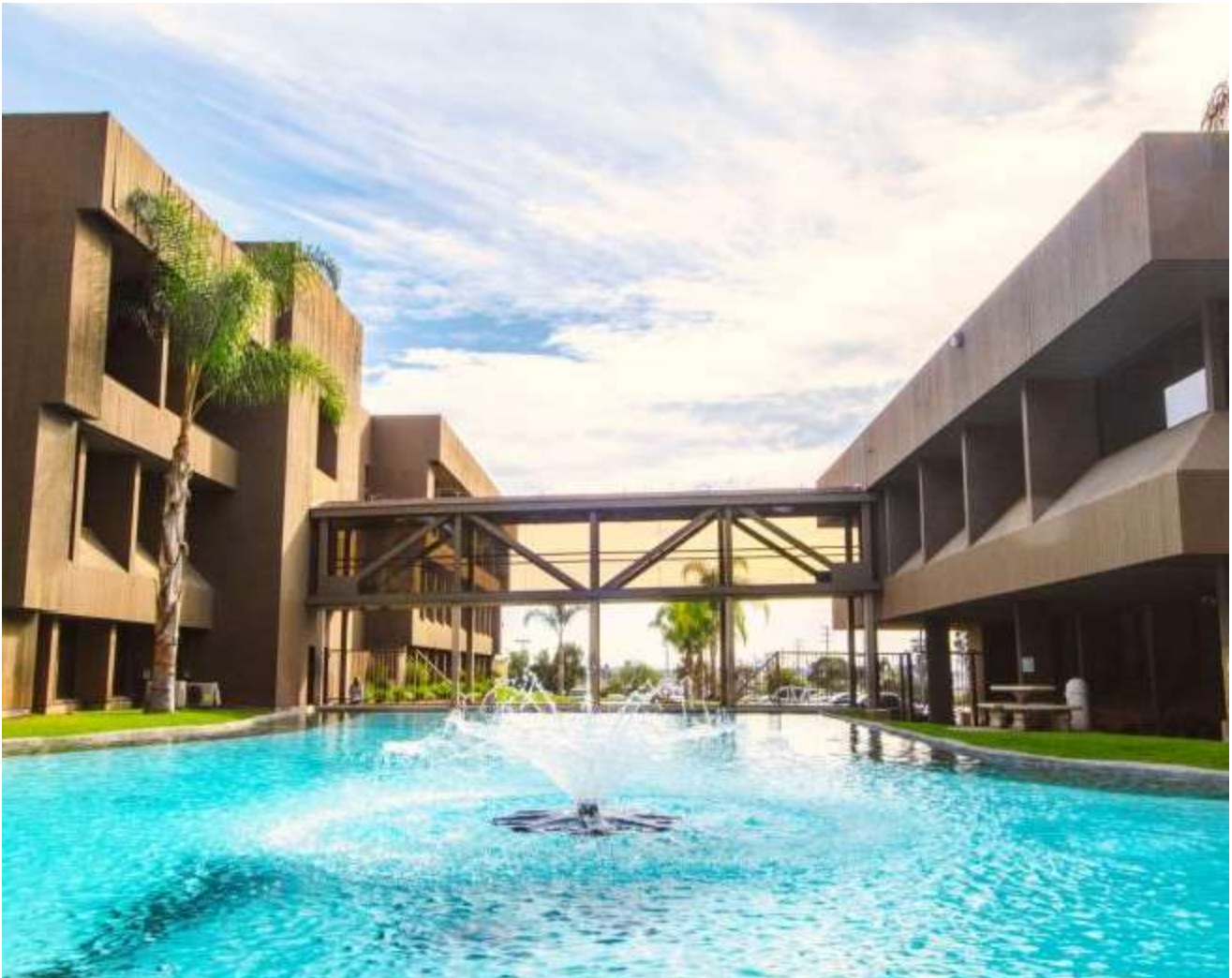
AUHS, Building 2 & 3