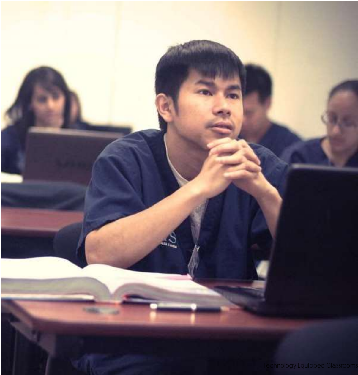
Technology Equipped Classrooms