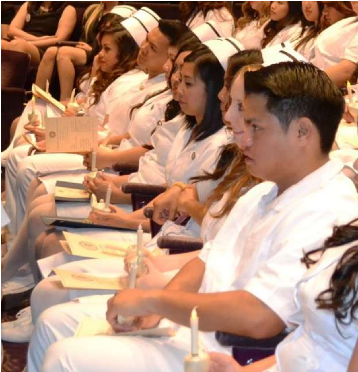
Pinning Ceremony, AUHS School of Nursing