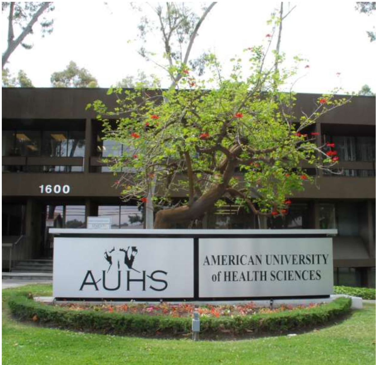
Front, American University of Health Sciences