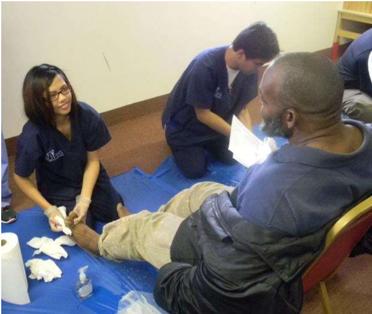
Community Service – A Core AUHS