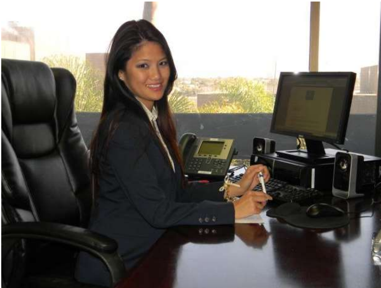
AUHS Career Services Office