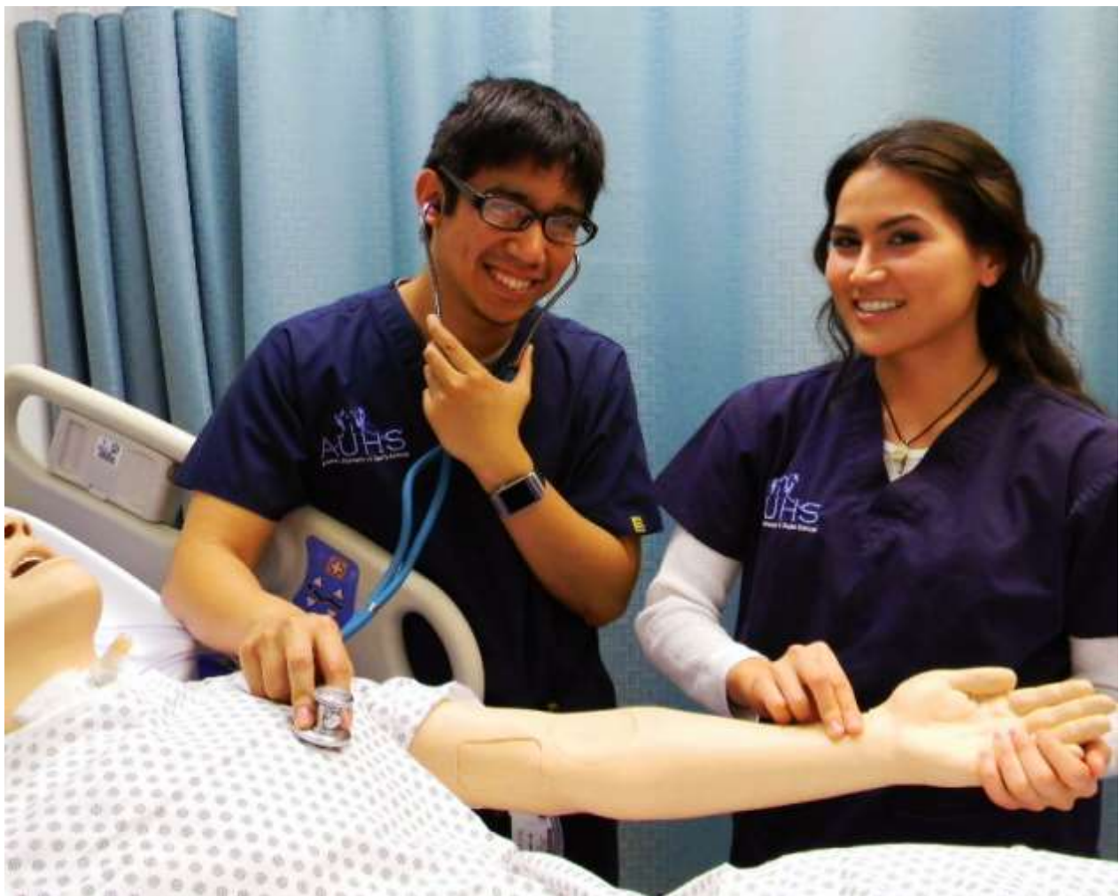
Nursing Students Clinical Readiness