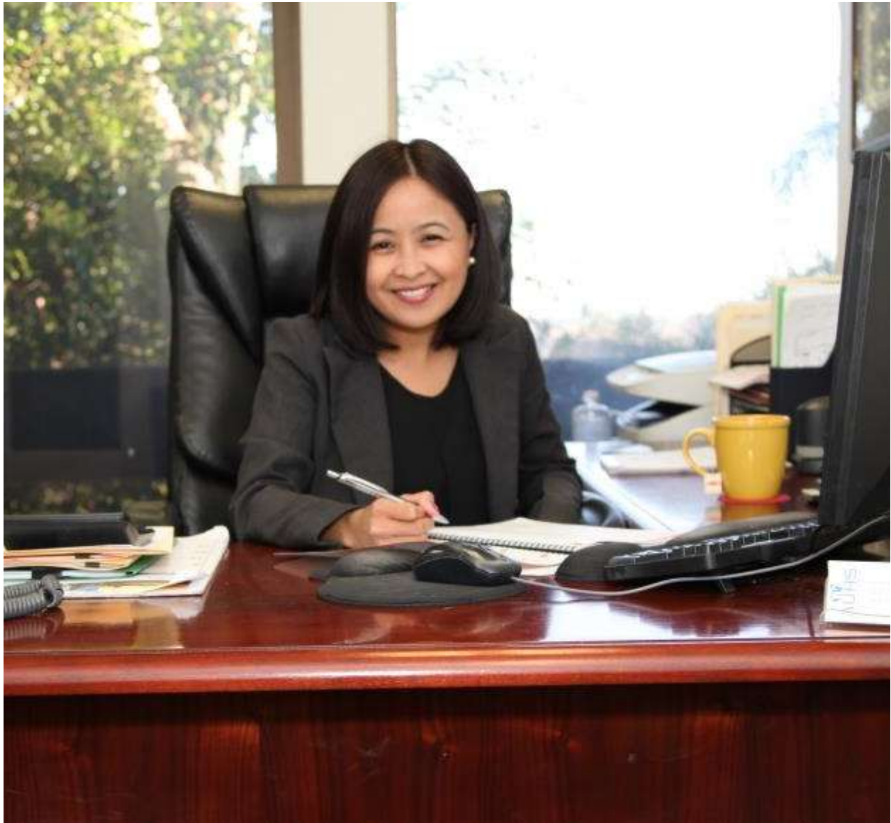
Office of the Students Affairs