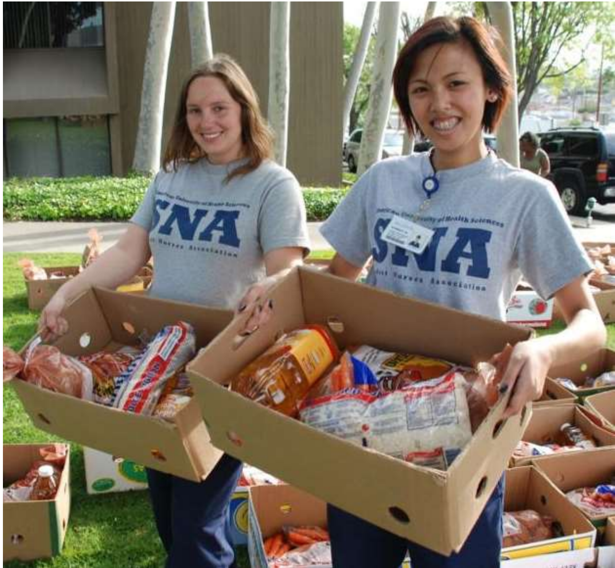
Nursing Students, giving away meals for the "Acts of Love" holiday event

That all might have the chance to believe, to learn, to create, to succeed.