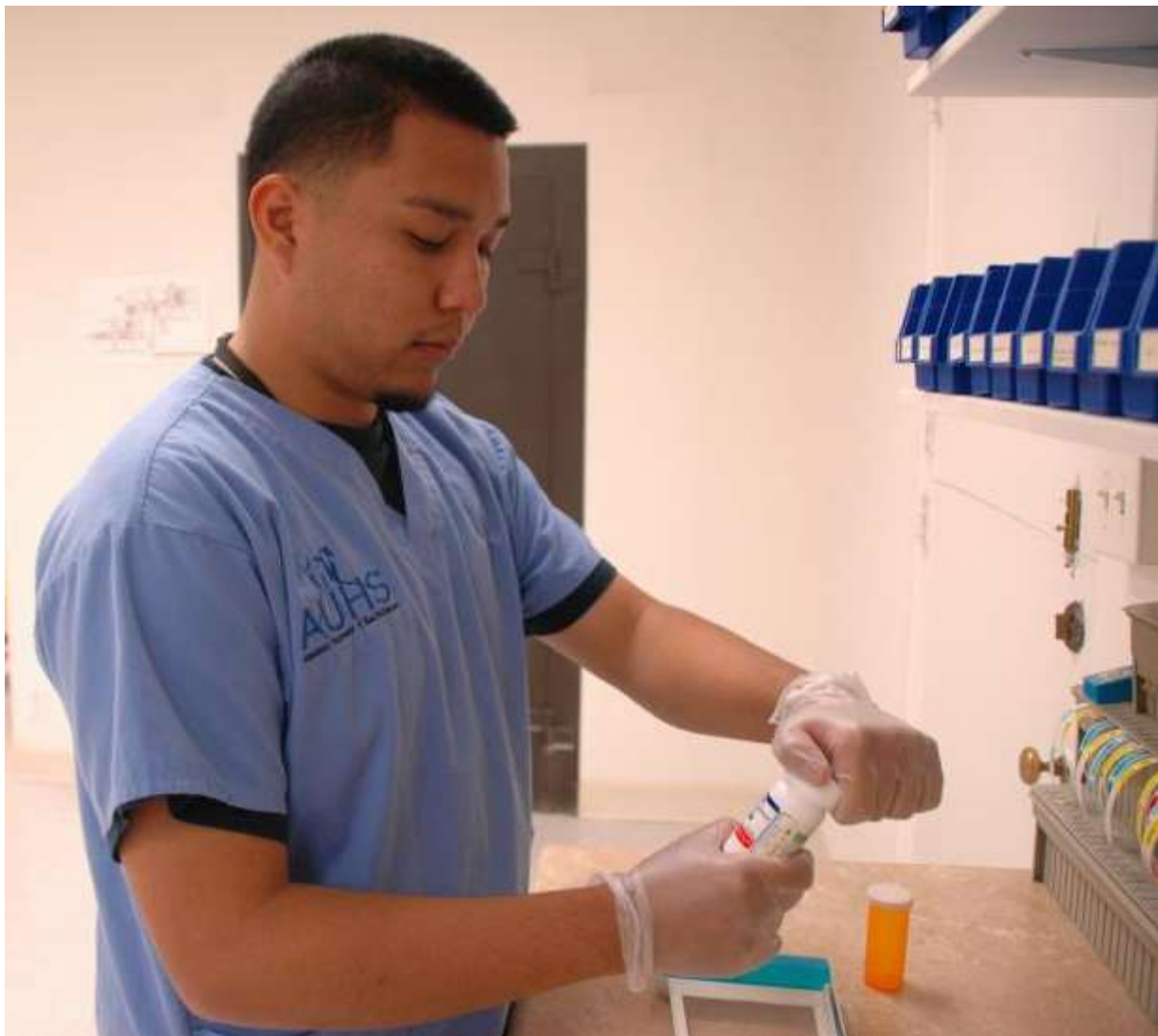
Prescription Dispensing Laboratory