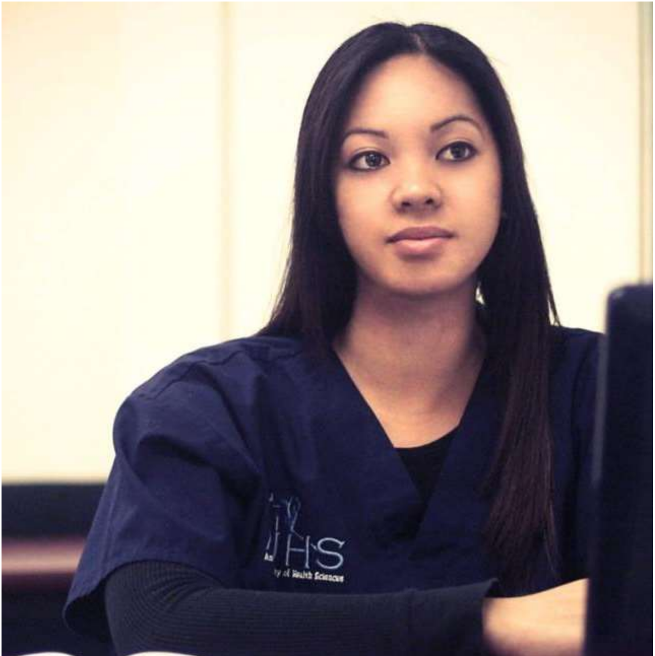
Student, School of Nursing, During Lecture