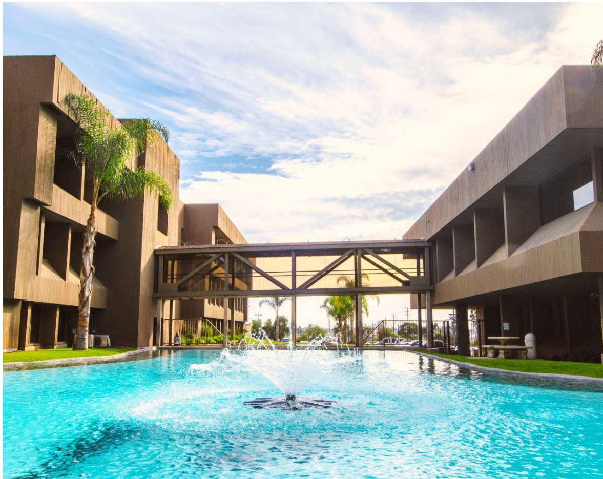
AUHS, Building 2 & 3