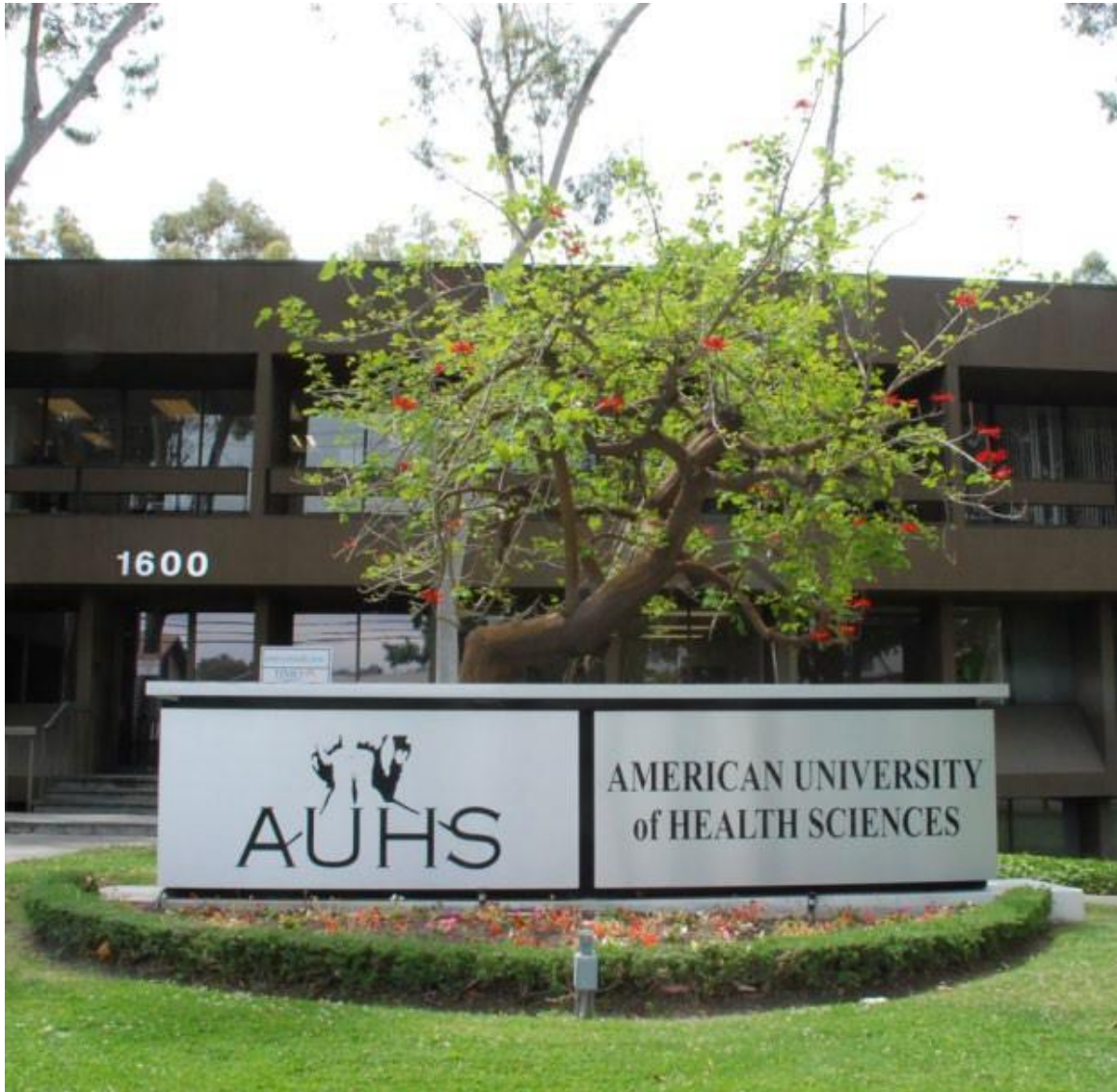
Front, American University of Health Sciences

“How blessed is the man who does not walk in the counsel of the wicked, nor stand in the path of sinners, nor sit in the seat of scoffers! But his delight is in the law of the LORD, and His law he meditates day and night. He will be like a tree firmly planted by streams of water, which yields its fruit in its season and its leaf does not wither; and in whatever he does, he prospers.” - Psalm 1:1-3 -