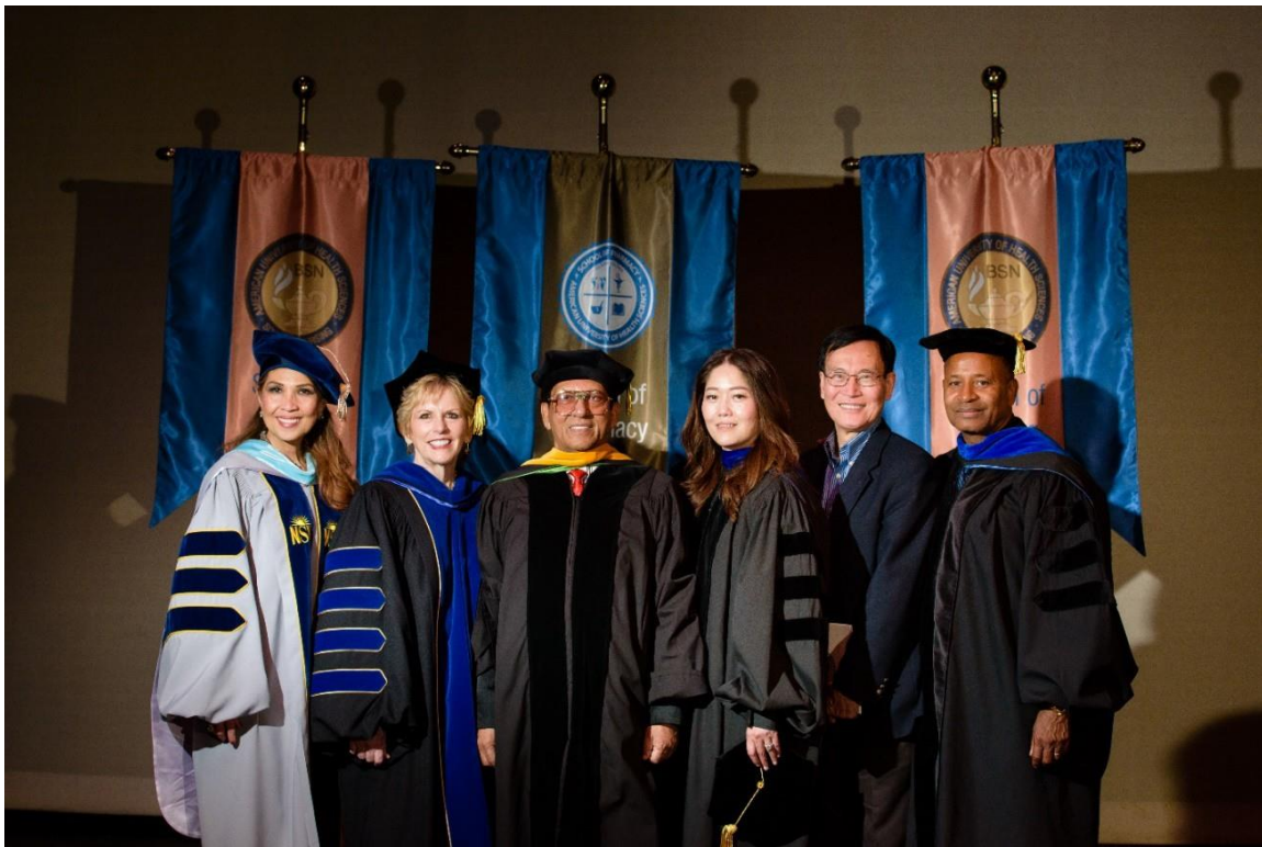
AUHS Commencement, 2018