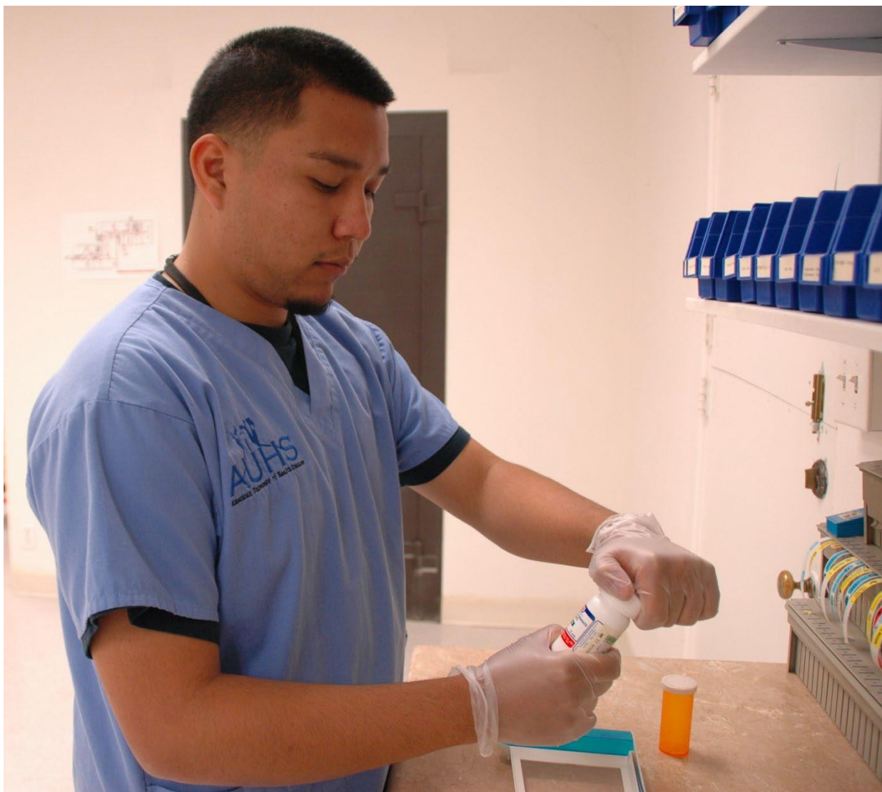
Prescription Dispensing Laboratory