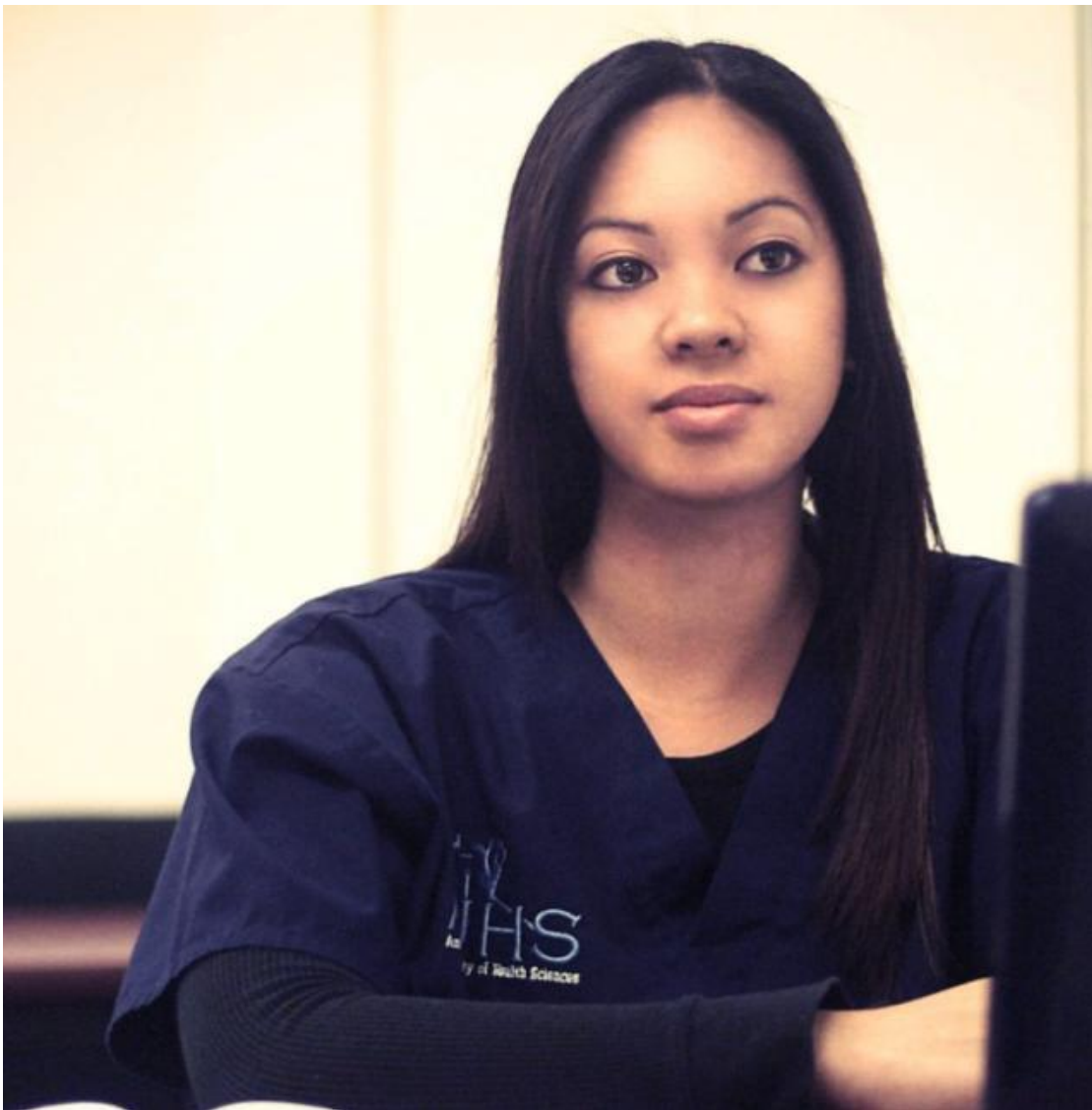
Student, School of Nursing, During Lecture