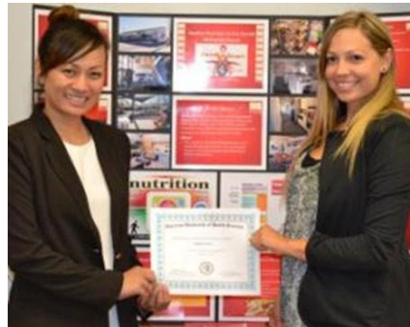
B.S. in Nursing, Student Poster Session

A degree program that is unaccredited or a degree from an unaccredited institution is not recognized for some employment positions, including, but not limited to, positions with the State of California. Student enrolled in an unaccredited institution is not eligible for federal financial aid programs.