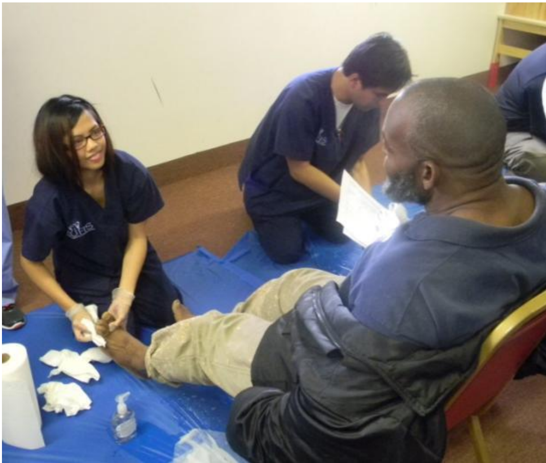
Community Service – A Core AUHS