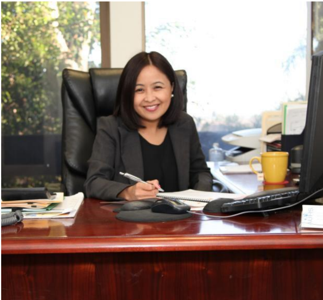
Office of the Students Affairs