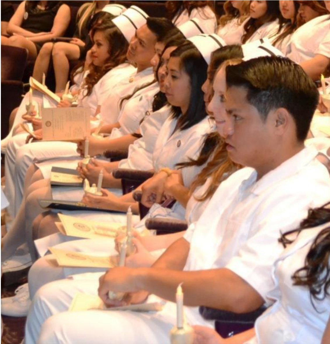
Pinning Ceremony, AUHS School of Nursing