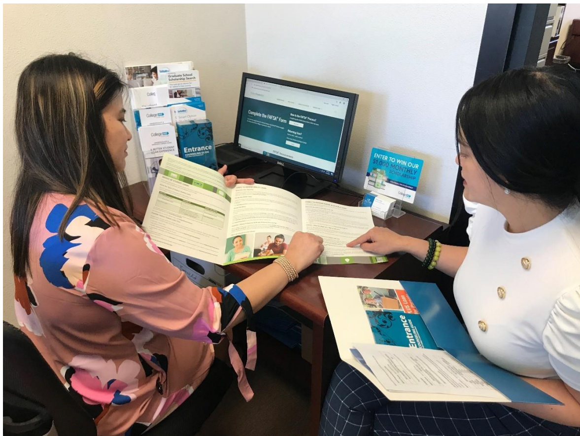
Financial Aid Department