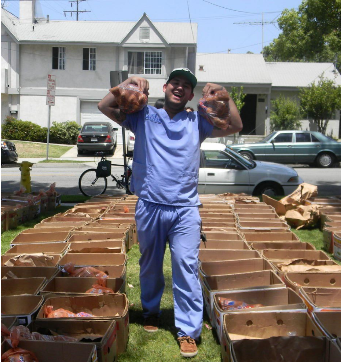
Annual Thanksgiving Food Drive