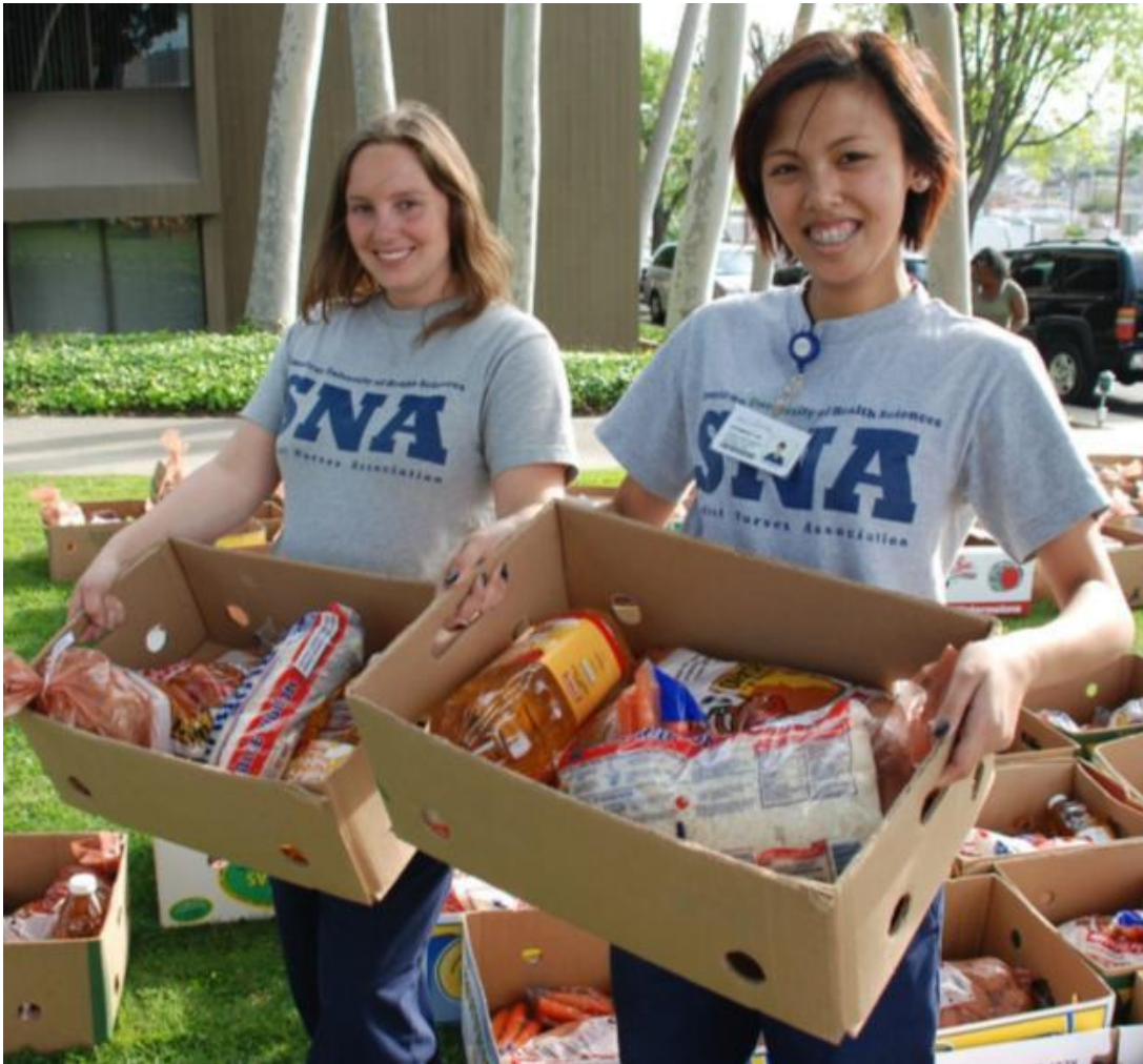
Nursing Students, giving away meals for the "Acts of Love" holiday event

That all might have the chance to believe, to learn, to create, to succeed.