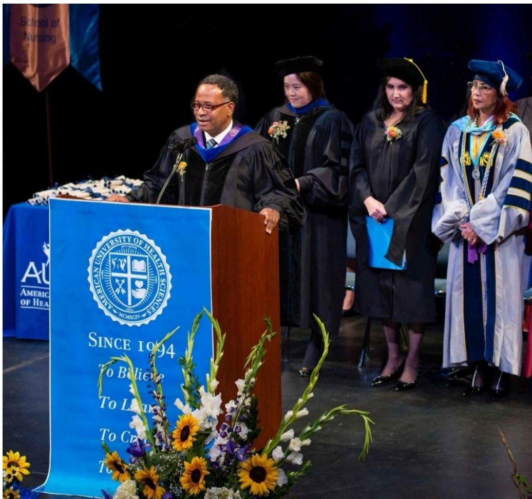
Graduation Ceremony Invocation